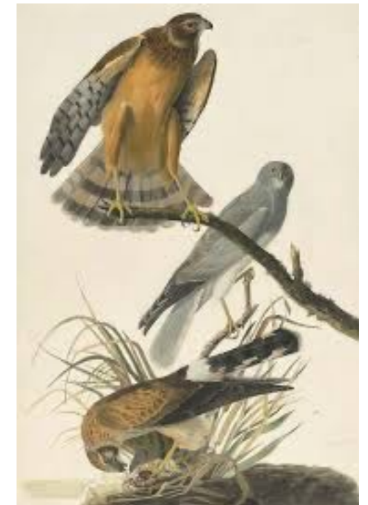
Northern harrier ( Circus cyaneus )