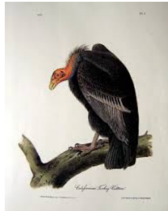
Turkey vulture ( Cathartes aura )