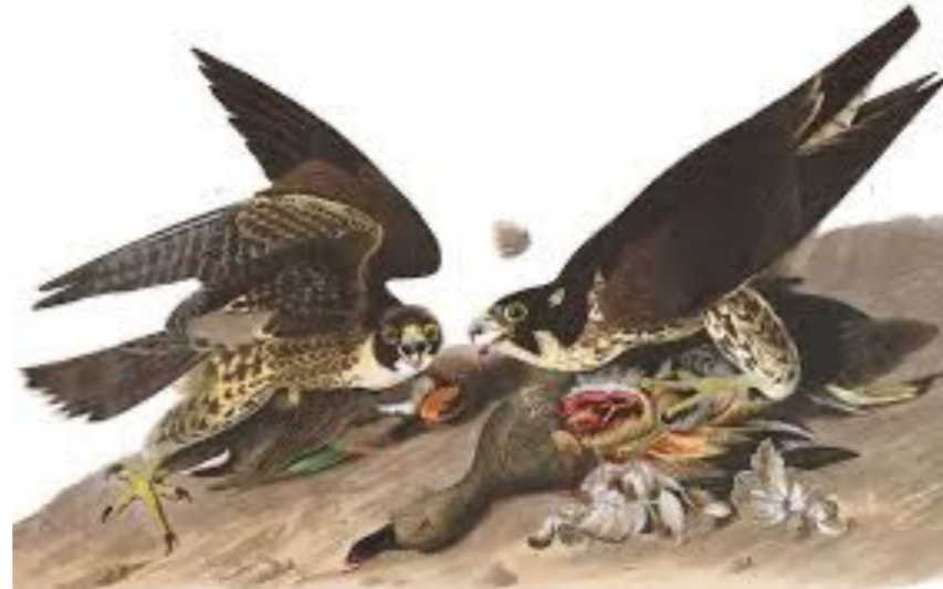
Peregrine falcon ( Falco peregrinus )

Raptors tolerate each other in fall and winter, as they take full advantage of the abundant prey. Keep an eye out for these: