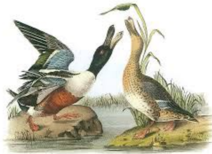
Northern shoveler ( Anas clypeata )