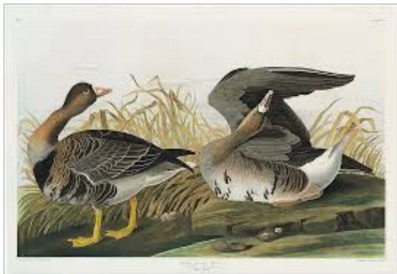
Greater white-fronted goose ( Anser albifrons )