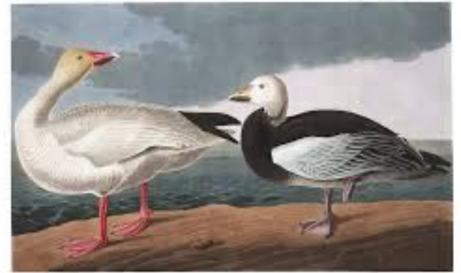
Snow goose ( Chen caerulescens )

Also abundant in District 10 are white-faced ibis, a resident bird that congregates in large flocks in winter.