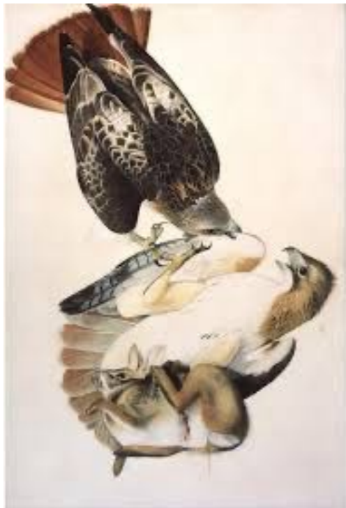
Red-tailed hawk ( Buteo jamaicensis )