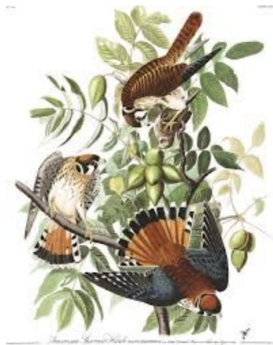
American kestrel ( Falco sparverius )