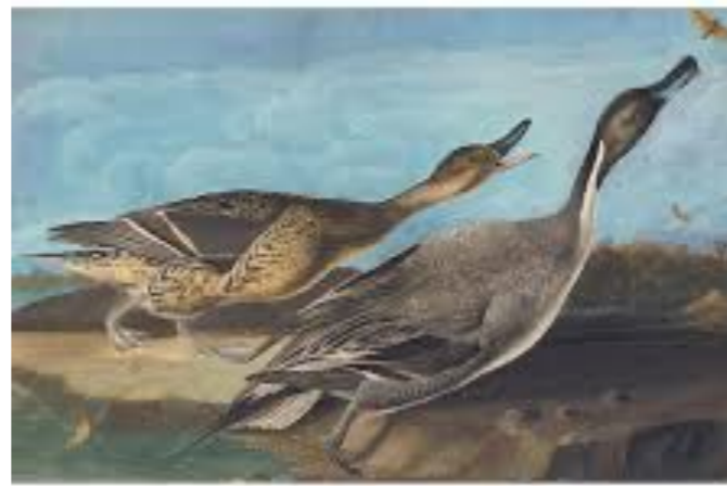
Northern pintail ( Anas acuta )