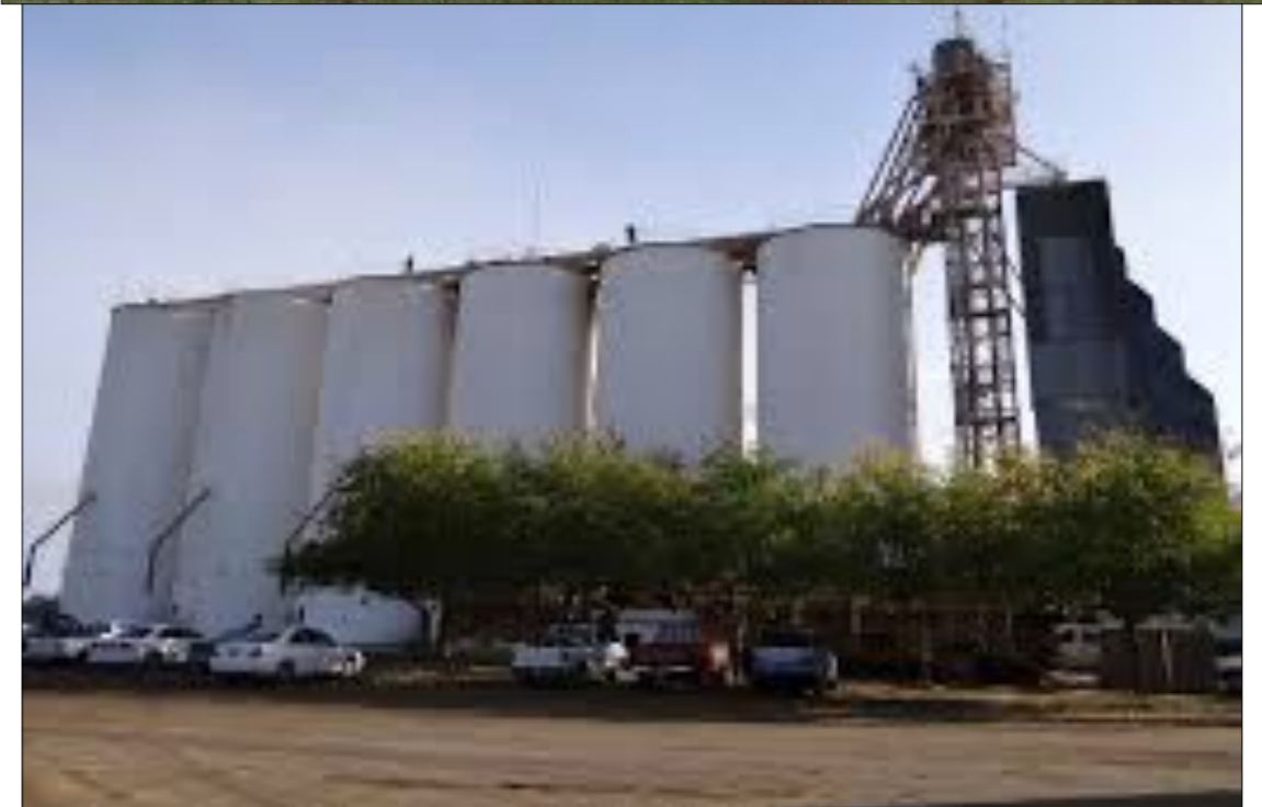
Mathews Rice Dryers