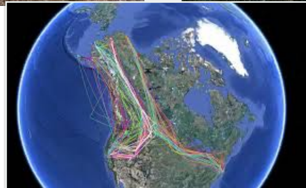
Satellite images of tundra swan migration