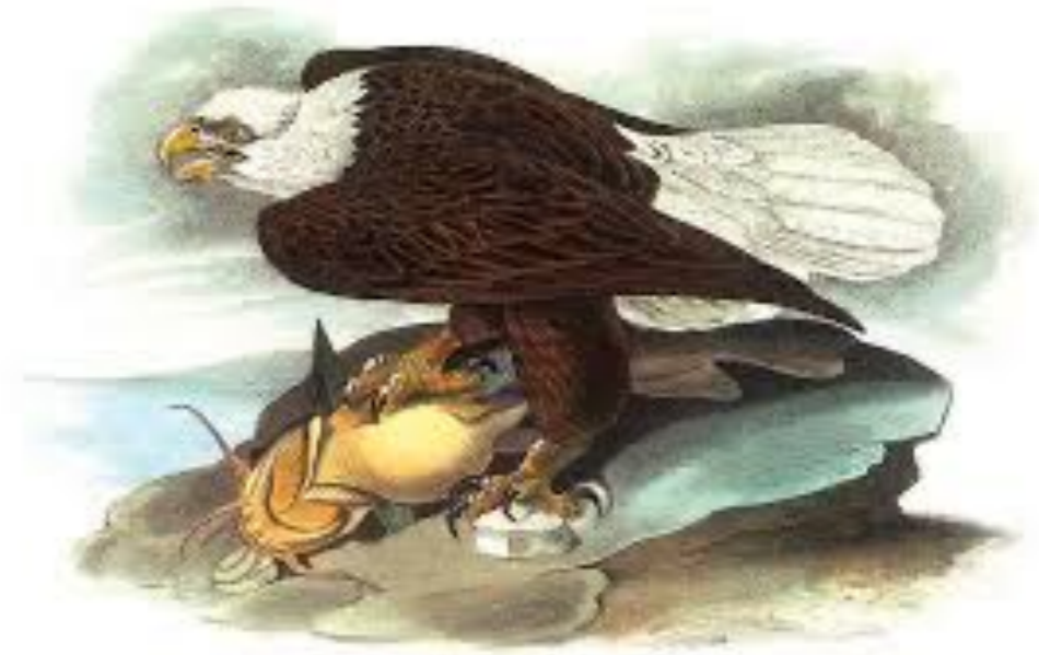
Bald eagle ( Haliaeetus leucocephalus )