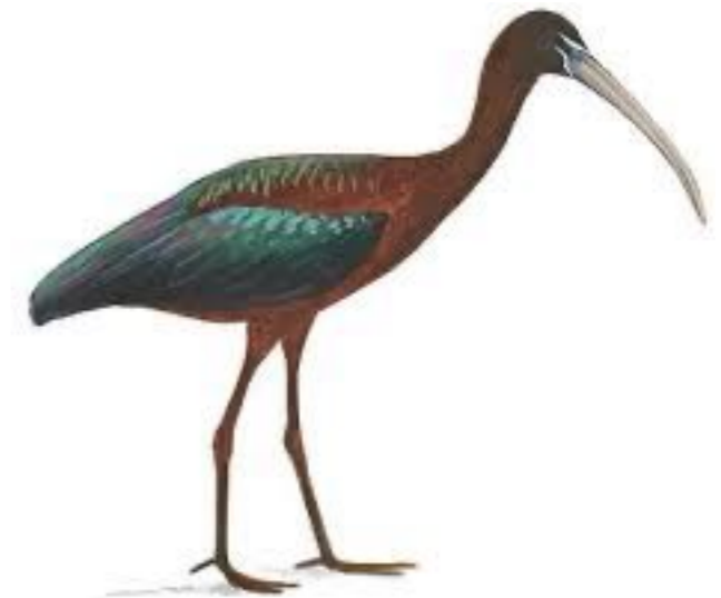
White-faced ibis ( Plegadis chihi )

Also abundant in District 10 are white-faced ibis, a resident bird that congregates in large flocks in winter.