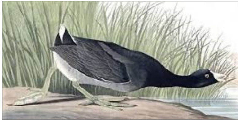
American coot ( Fulica americana )

While you can set your watch to the tundra swan migration calendar —arriving the first week of November and leaving the second week of January—for most migratory birds, it is weather events that push them down south from the north. These migratory birds include: